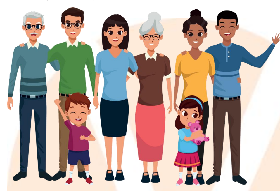
II. This is a nuclear family.