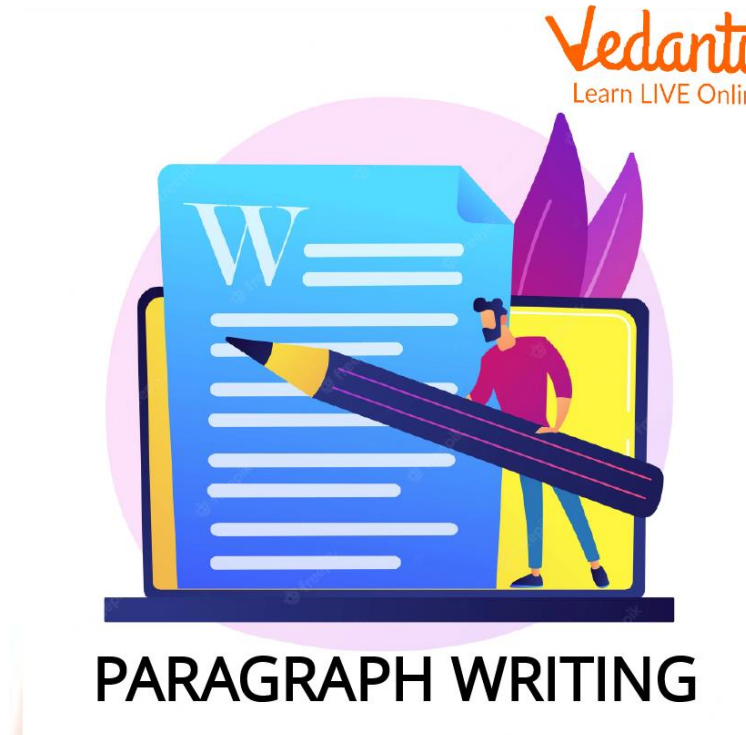
Image: Paragraph Writing