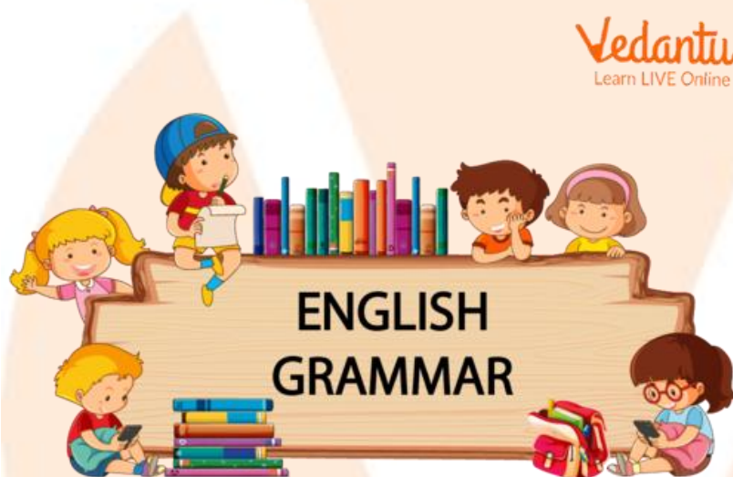
Image: English Grammar

In this chapter we are going to develop our story writing skills, how to improve them, and tips for writing better and more effective stories. You are provided with various examples of different stories as well as practice questions to assess yourself.