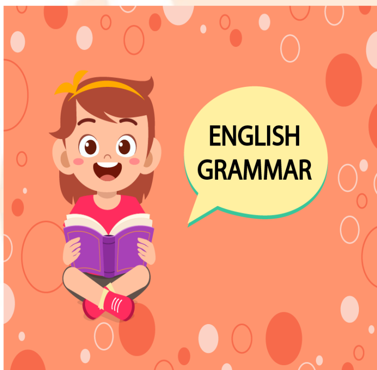
Image: English Grammar