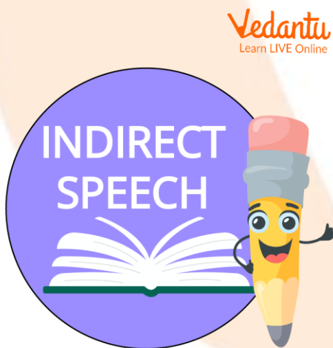
Image: Indirect Speech

It is the speech that tells what someone has said but it does not explain the actual words spoken by the person. It just conveys the basic narration of what is being said to the third person.