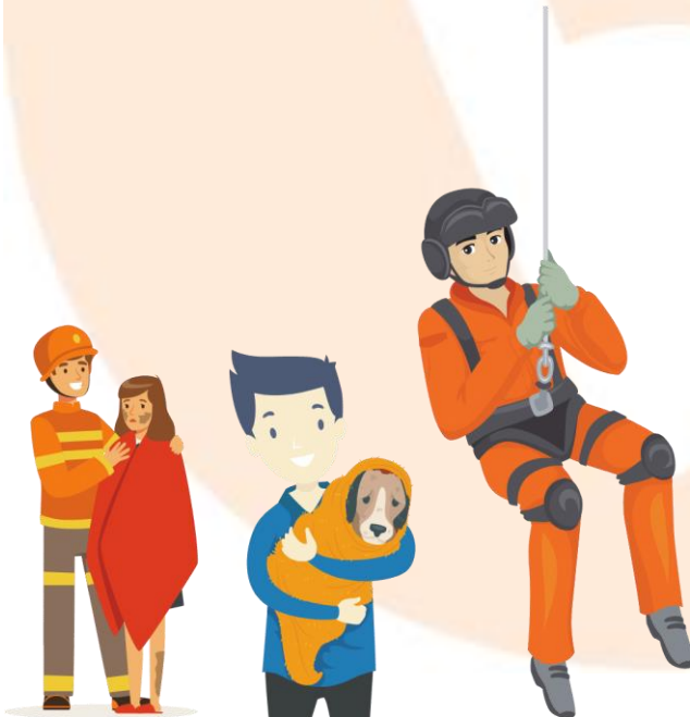
Image: Rescuing people