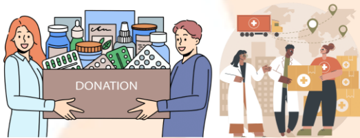
Image: Distribution of essential commodities to affected people

17. Observe the picture and write your observation.