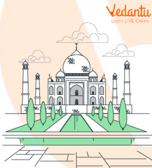
Image: The Taj Mahal

Unlike, the common noun it doesn't refer to the names of the community rather it refers to the names in particular.