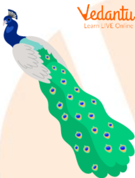
Image: Example of noun