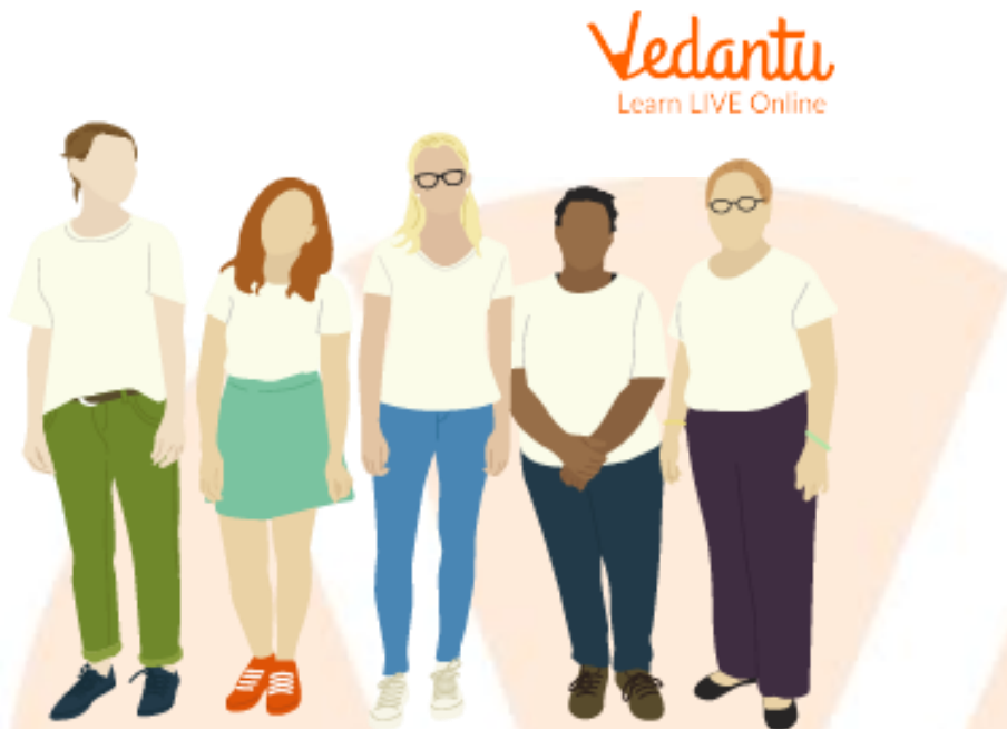
Image: Group of People

collection of bees or flees, A flock is a group of sheep, gang A shoal is a group of fish.